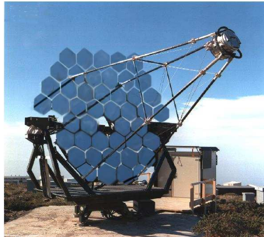
FIGURE 1. Photomontage of the DWARF telescope.

Telescope structure. The former HEGRA telescope CT3 at the Observatorio del Roque de los Muchachos (ORM), now owned by the MAGIC collaboration, will be refurbished and equipped for robotic operation to reduce costs and man power demands.